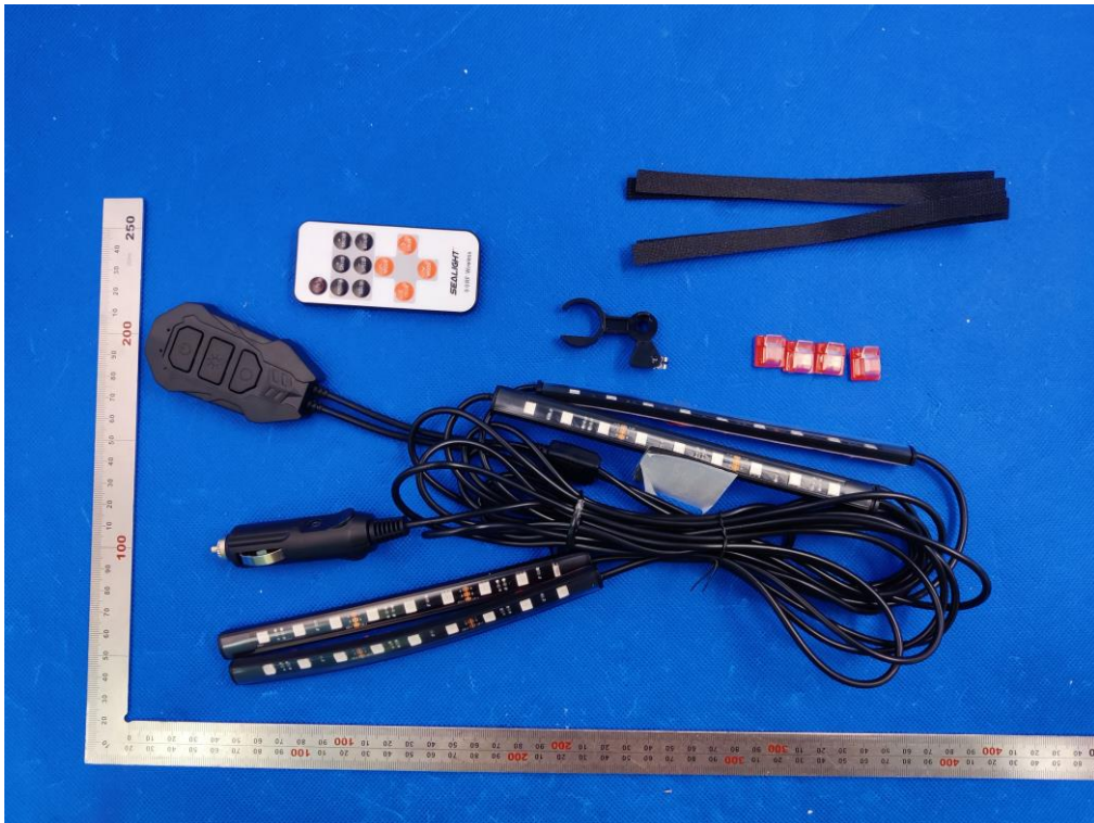
TOP VIEW OF EUT