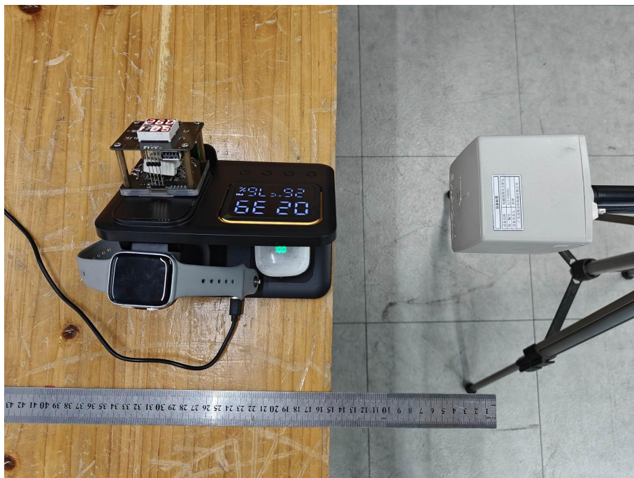
Test Position B-15cm from the edge of EUT to the geometric center of the probe