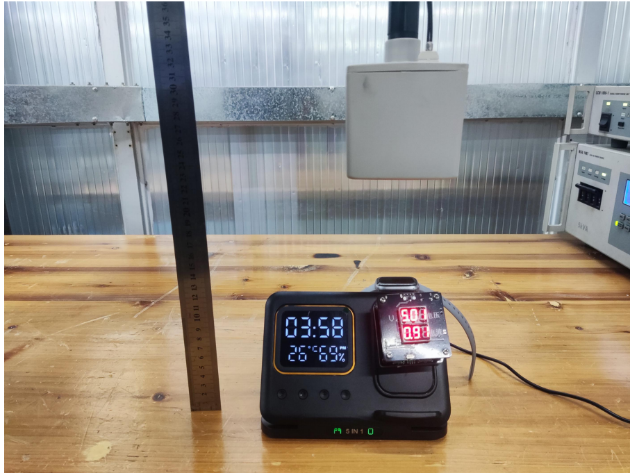
Test Position E-15cm from the edge of EUT to the geometric center of the probe