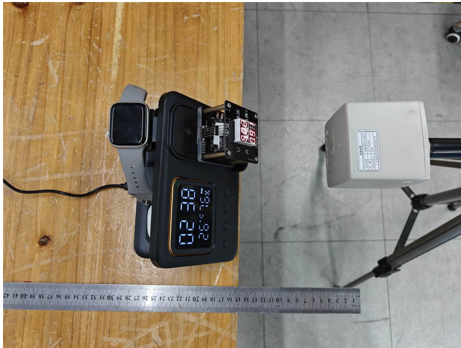
Test Position A-15cm from the edge of EUT to the geometric center of the probe