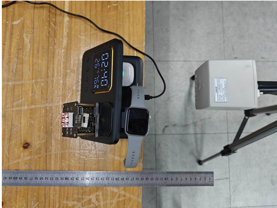
Test Position C-15cm from the edge of EUT to the geometric center of the probe