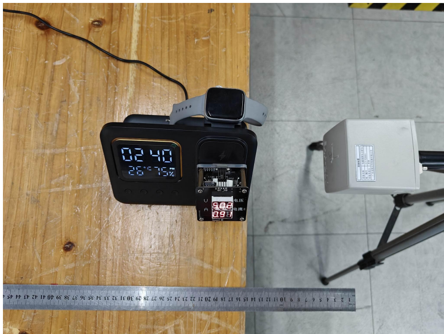
Test Position D-15cm from the edge of EUT to the geometric center of the probe