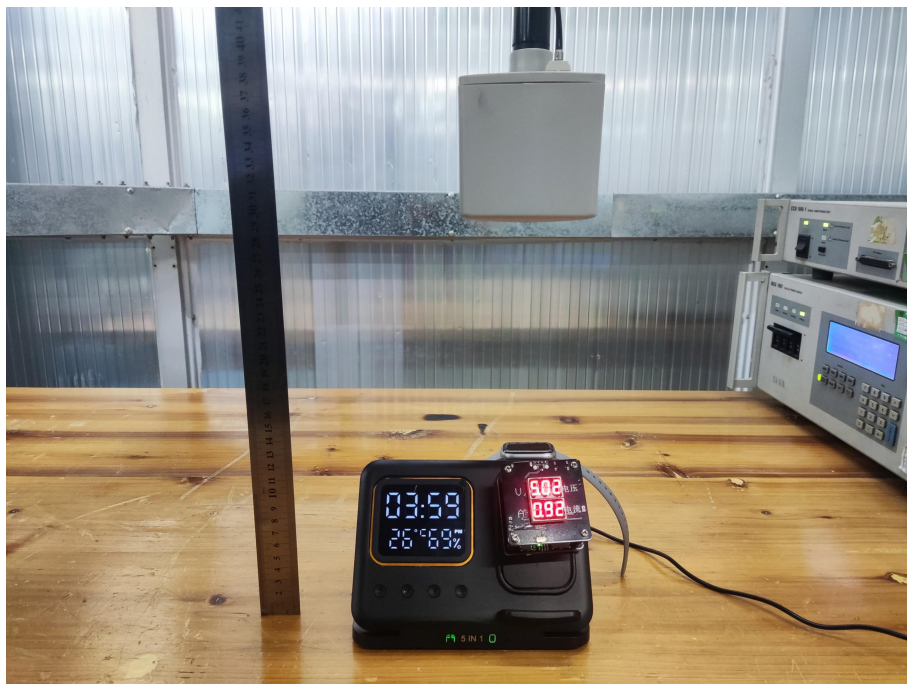
Test Position E-20cm from the edge of EUT to the geometric center of the probe