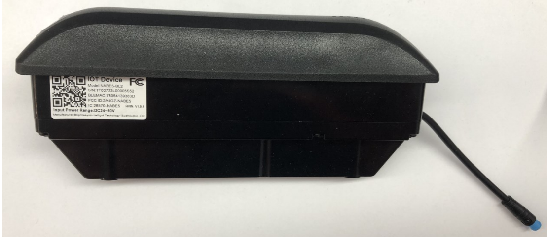
Figure 1. NABE5-BL2 Products View