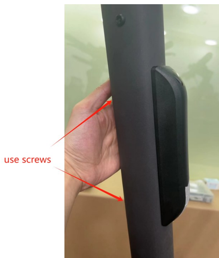
Figure 4. Install the IoT device

Please install the IoT device into a dedicated Scooter or use the corresponding connector to connect to the IoT device.