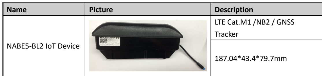
Table 4. NABE5-BL2 Parts List