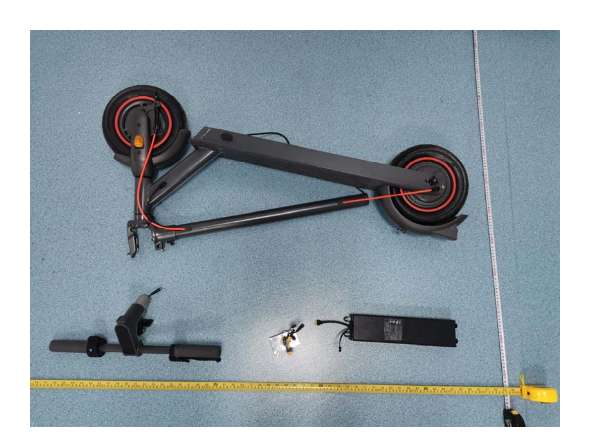
EXHIBIT C - EUT INTERNAL PHOTOGRAPHS