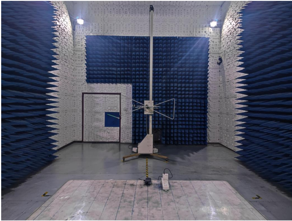
RADIATED EMISSION TEST SETUP ABOVE 1GHz