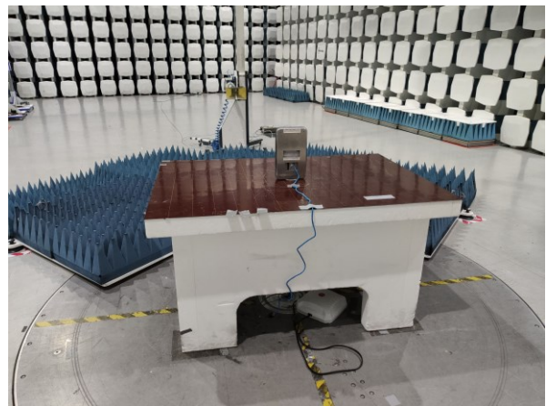
Radiated Emissions 30 – 1000 MHz