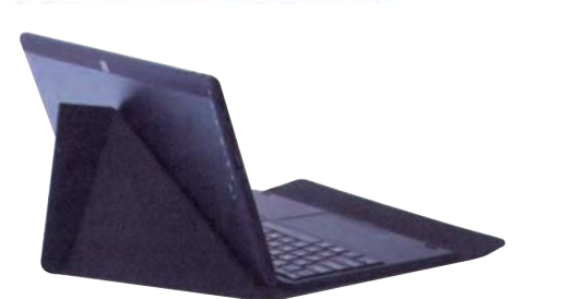
Use of tablet and keyboard Hall-effect switch Tablet PC with keyboard to Cover, Windows OS Automatically enlared into the Sleep. -5-

Movable base keyboard interface This interface is magnetic, which is convenient for alignment and firmly linking the Table PC and the keyboard. ② Keyboard group: The keyboard group provides full size QWERTY key and best typewriting comfortability. ② Touch Tablet: Used to control the cursor on the Tablet PC, with the same function as a mouse Base: Folding base of Tablet PC.