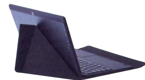
Use of tablet and keyboard Hall-effect switch Tablet PC with keyboard to Cover, Windows OS Automatically entered into the Sleep.