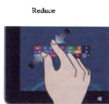
Reduce On the touch screen, narrow two fingers to reduce the image.