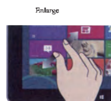
Enlarge On the touch screen, widen two fingers to enlarge the image.