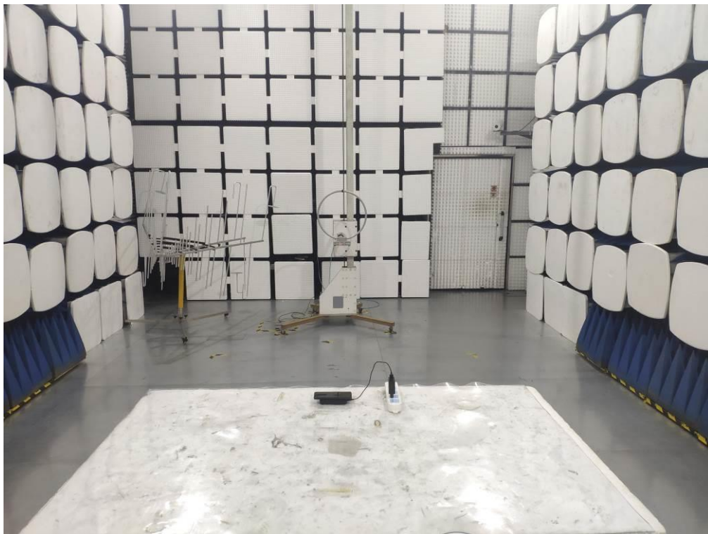
Radiated Emission below 30MHz