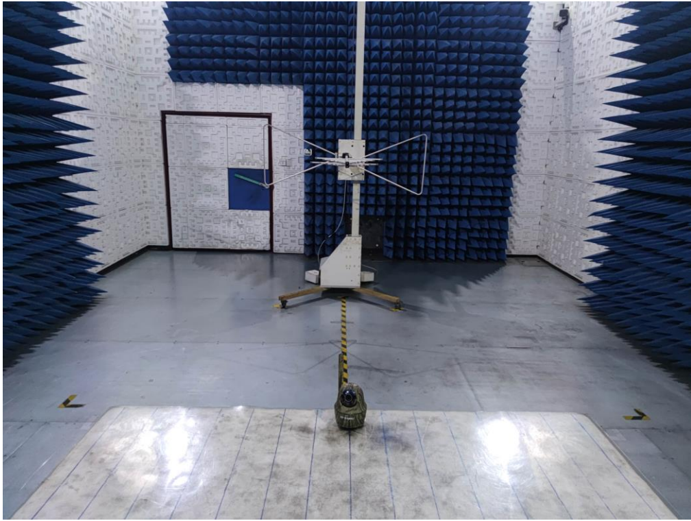
RADIATED EMISSION TEST SETUP ABOVE 1GHz