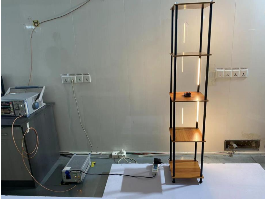
Radiated Emission Photo 1