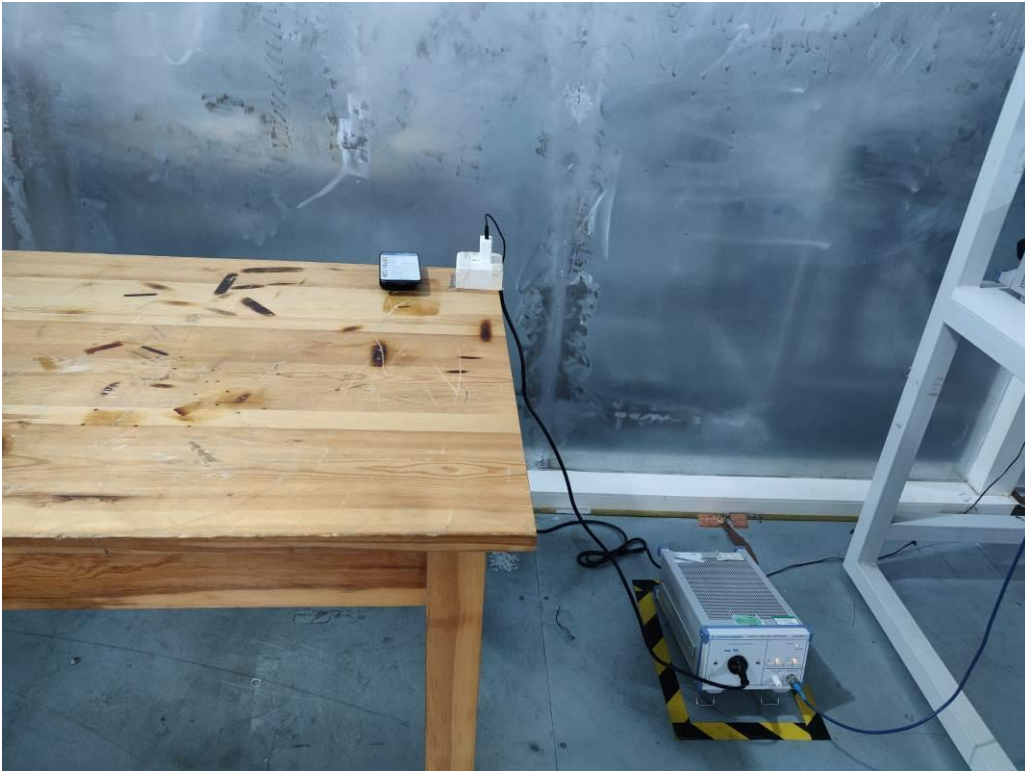
Conducted Emission-AC adapter charge mode