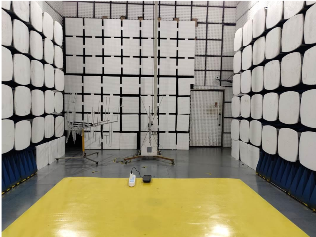
Radiated Emission Below 1 GHz