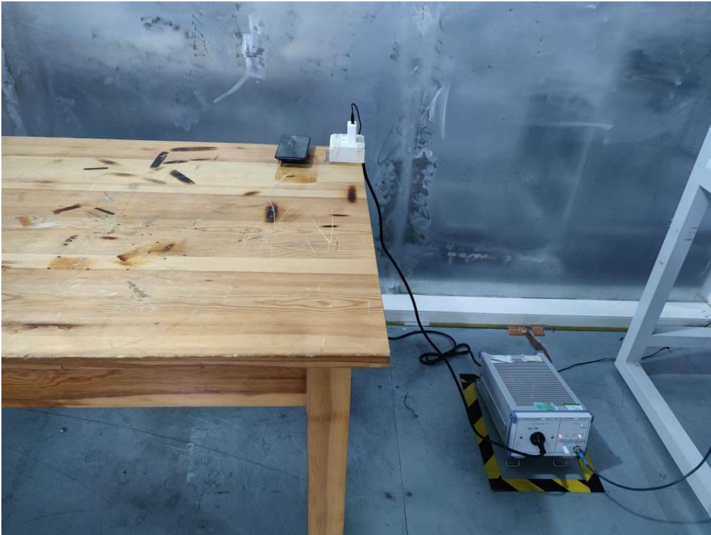
Conducted Emission-AC adapter charge mode