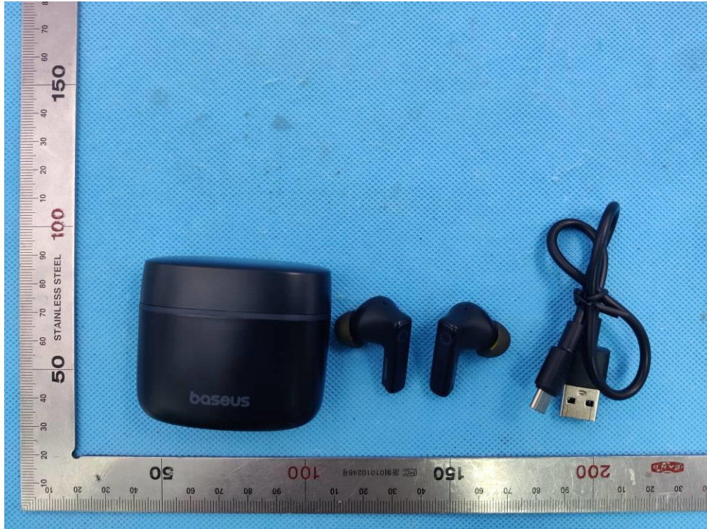
TOP VIEW OF EUT