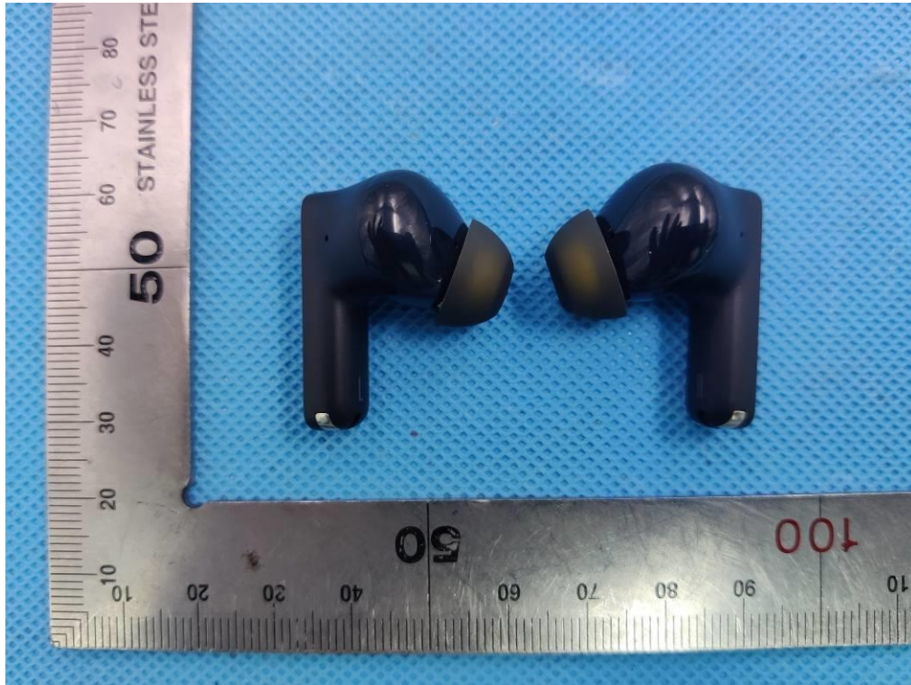
FRONT VIEW OF EUT