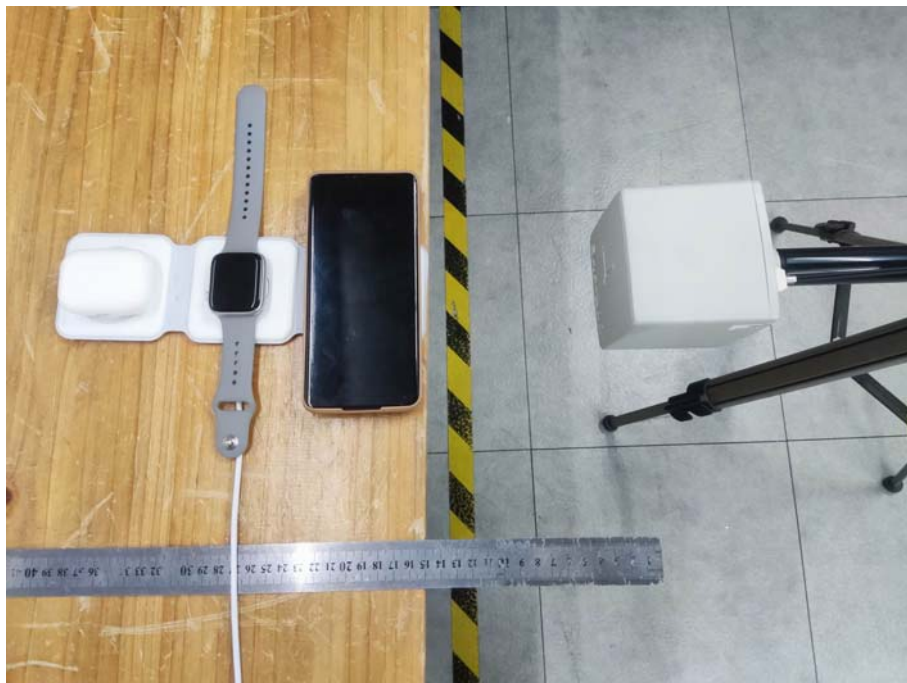
Test Position D-15cm from the edge of EUT to the geometric center of the probe