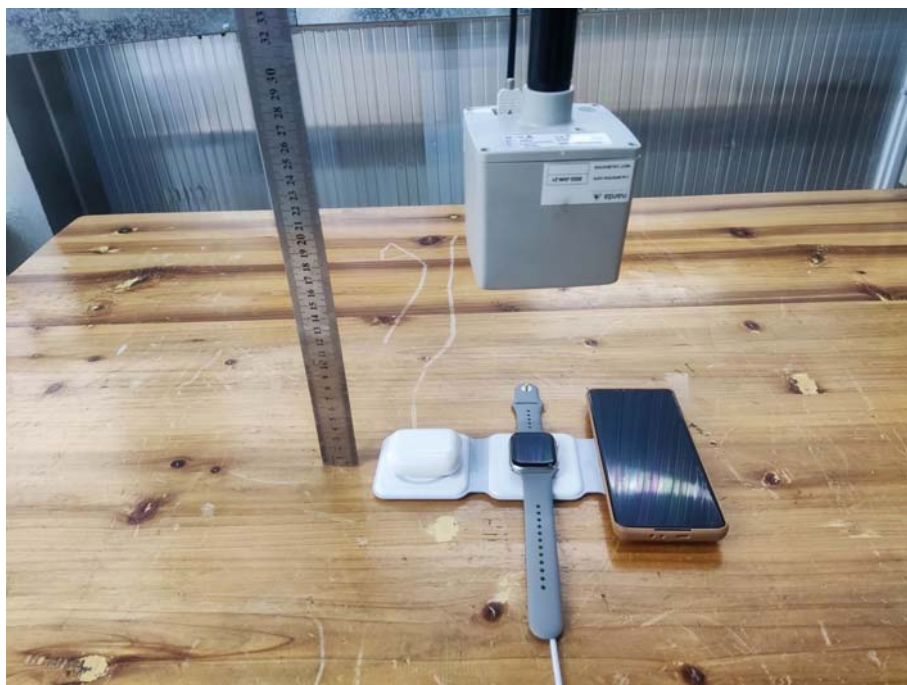
Test Position F-20cm from the edge of EUT to the geometric center of the probe