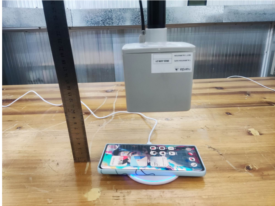
Test Position E-15cm from the edge of EUT to the geometric center of the probe