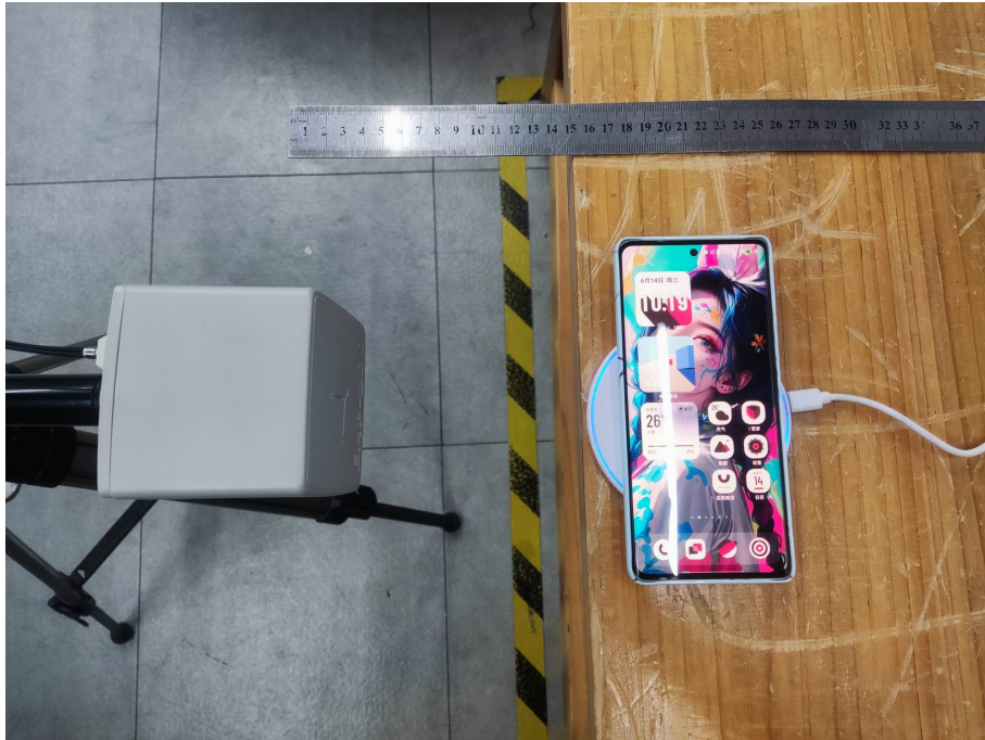
Test Position C-15cm from the edge of EUT to the geometric center of the probe