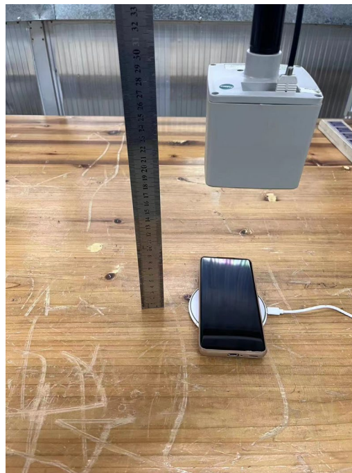
Test Position E-20cm from the edge of EUT to the geometric center of the probe