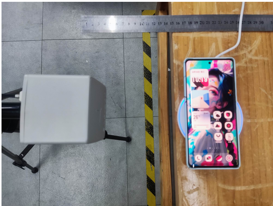
Test Position B-15cm from the edge of EUT to the geometric center of the probe