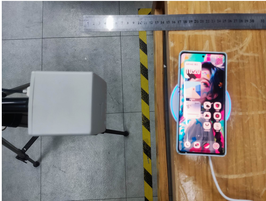
Test Position A-15cm from the edge of EUT to the geometric center of the probe