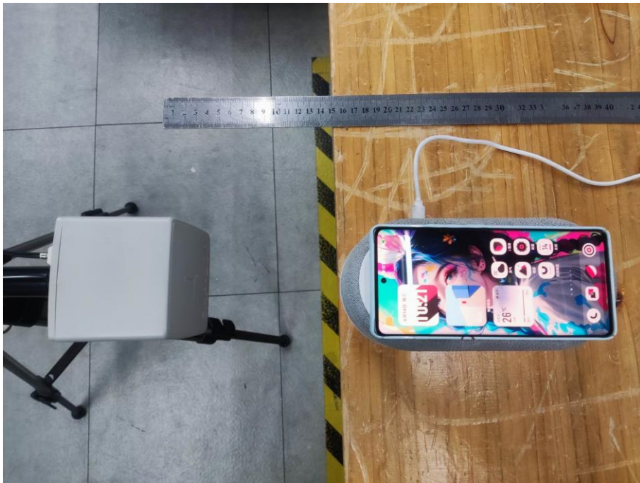
Test Position D-15cm from the edge of EUT to the geometric center of the probe