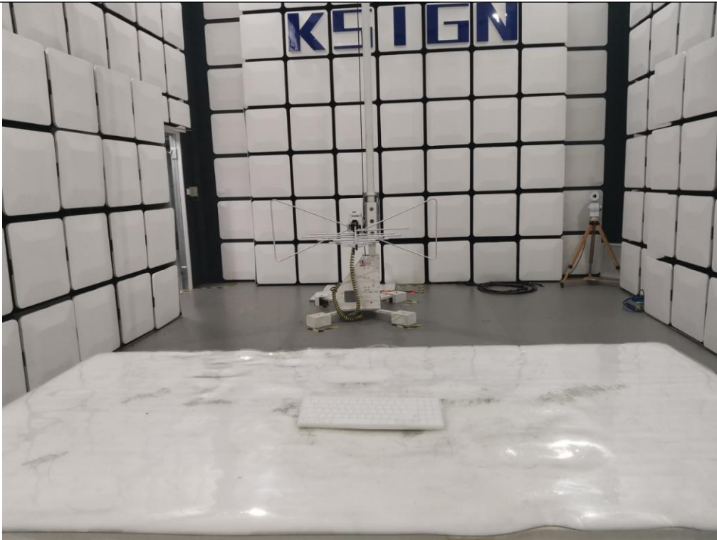
Radiated Measurement (Above 1GHz)