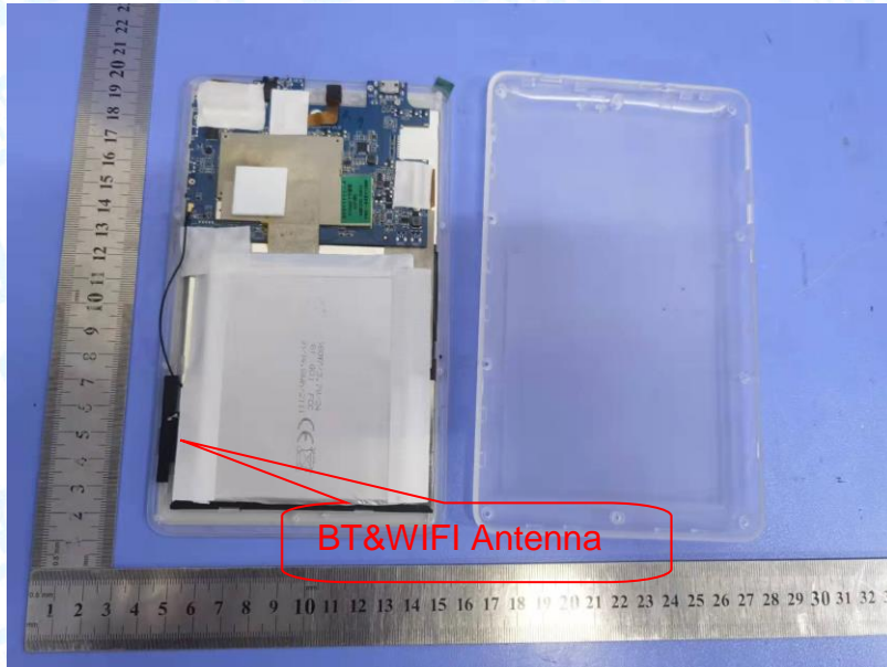
Photo 8 Appearance of PCB