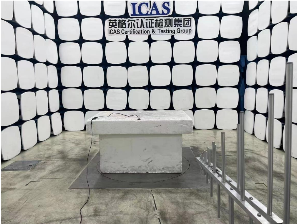
Below 1 GHz