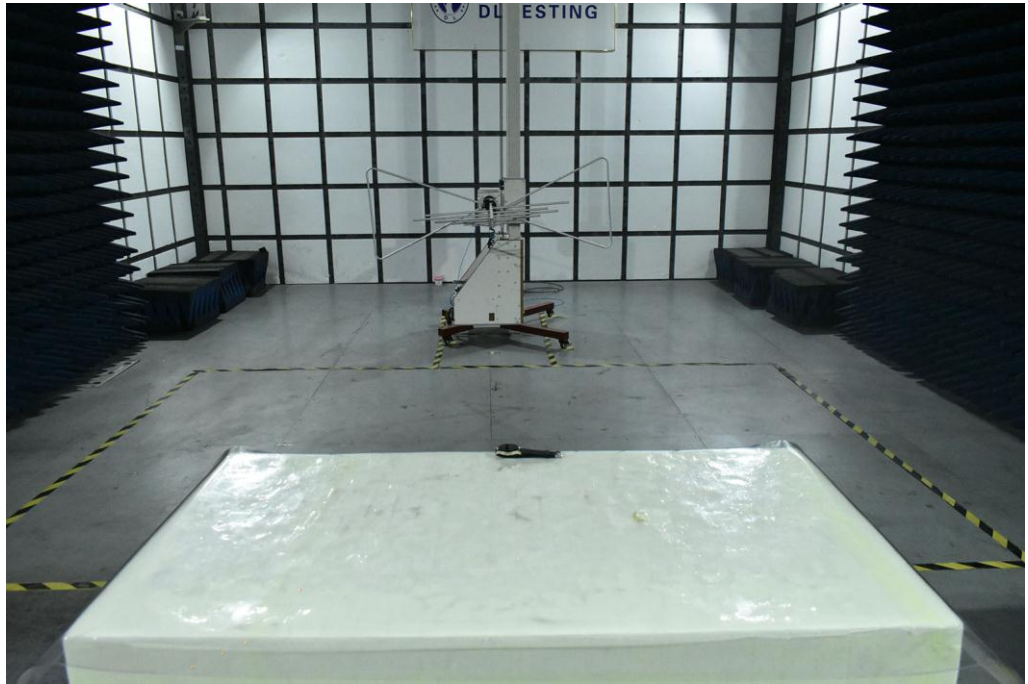
Radiated Measurement Photos