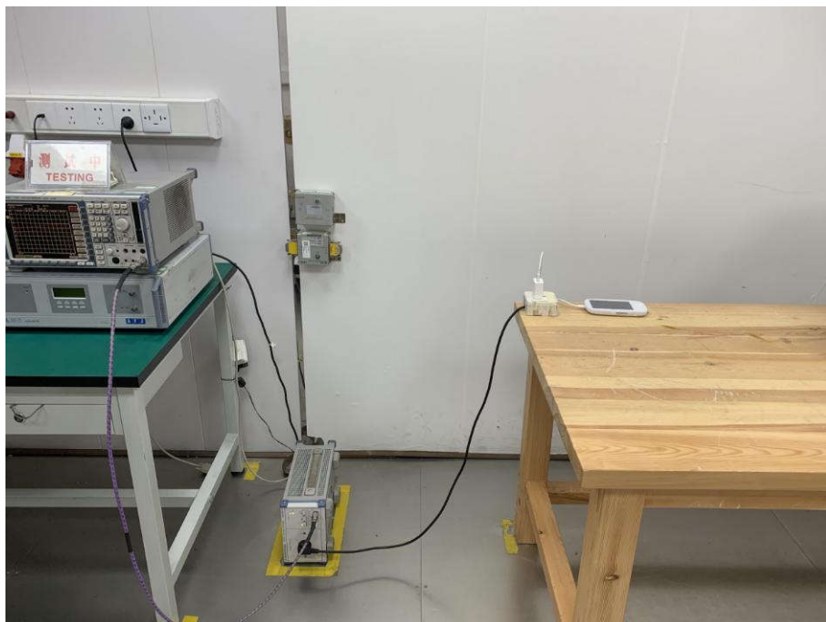
Conducted Emissions Test Setup-4