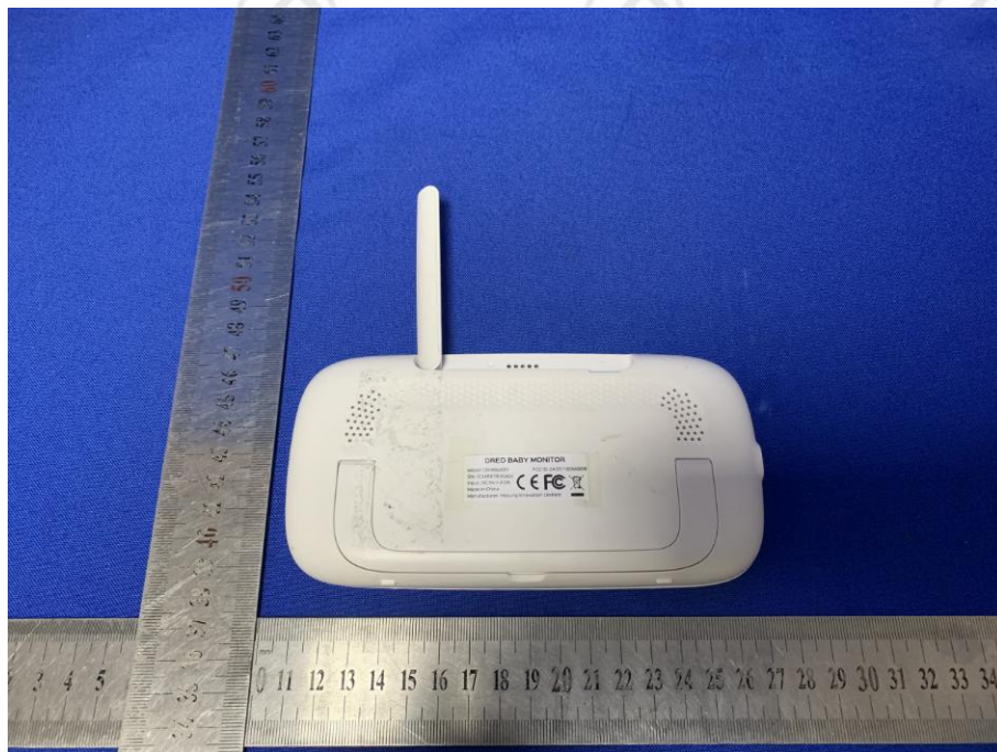
View of Product-8