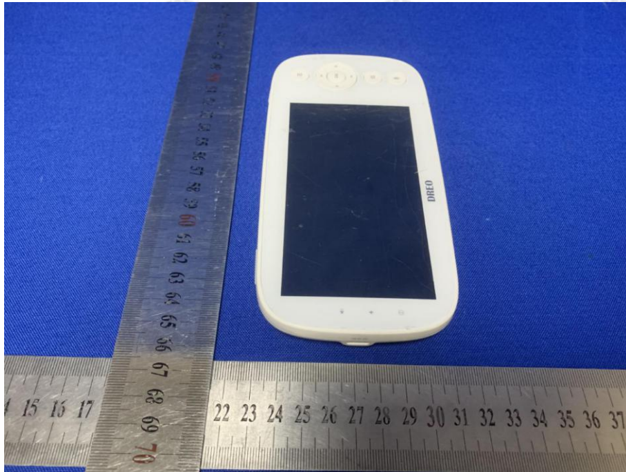
View of Product-7