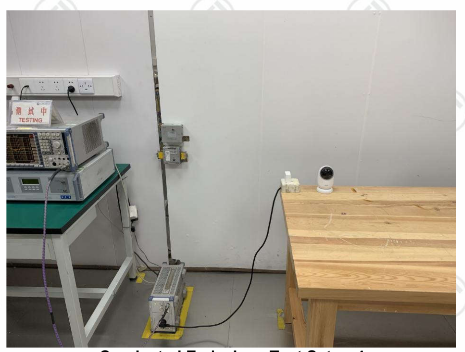
Conducted Emissions Test Setup-4