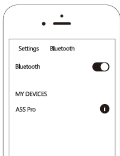
Search for headphones

In a shutdown state, long press the multifunction key for 3 seconds. The headphone blue light is always on for 3 seconds and the red/ blue lights flash alternately. At this time, the headphones enter the automatic Bluetooth pairing mode and the headphone voice prompts "beep". Turn on smart devices such as mobile phones, find "A5S Pro" from the Bluetooth list, and click on the connection; After confirming the connection, the headphone prompts "beep".