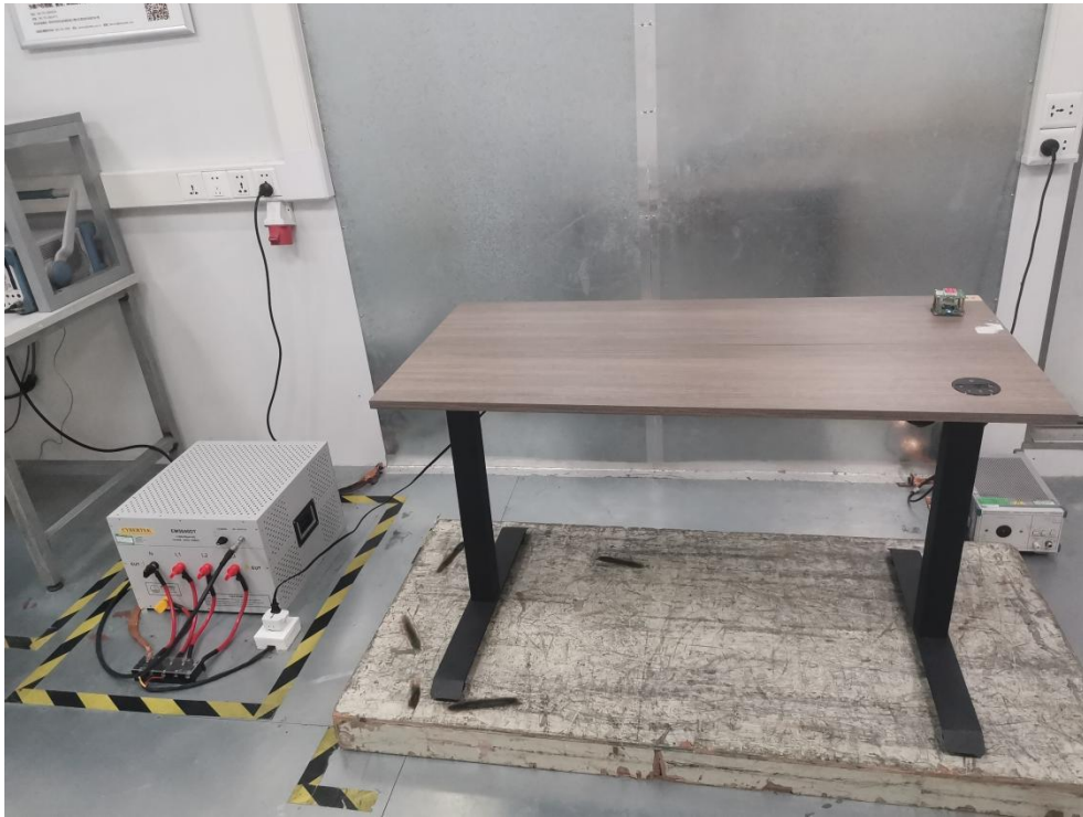
FCC ID: 2A3OW-K312 Photo of Conducted Emission Measurement