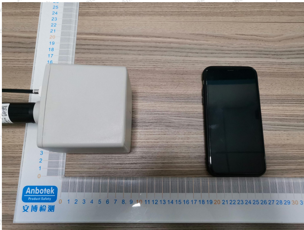
Photo of MPE Measurement