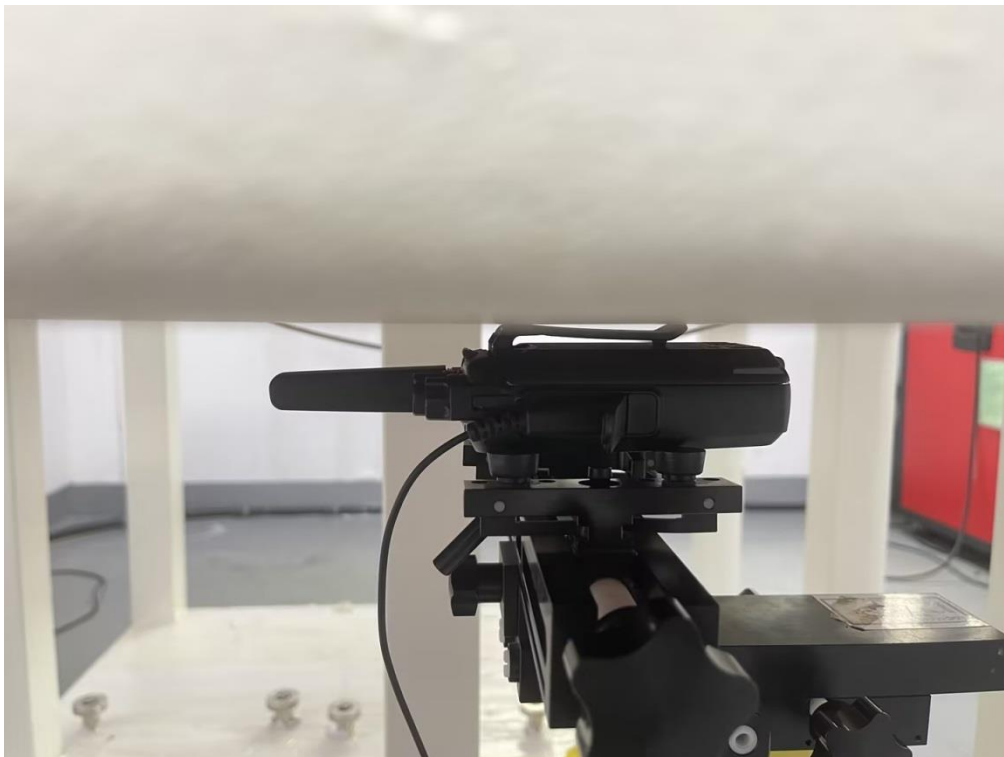
The thickness of EUT is 3.3 cm