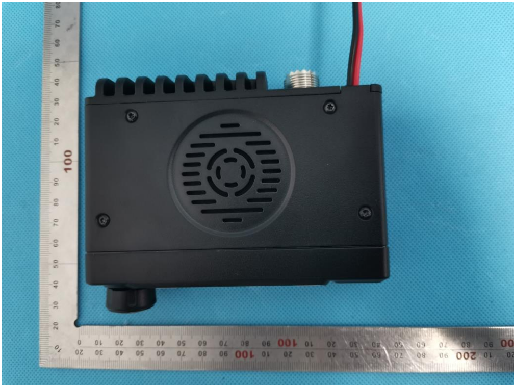
FRONT VIEW OF EUT