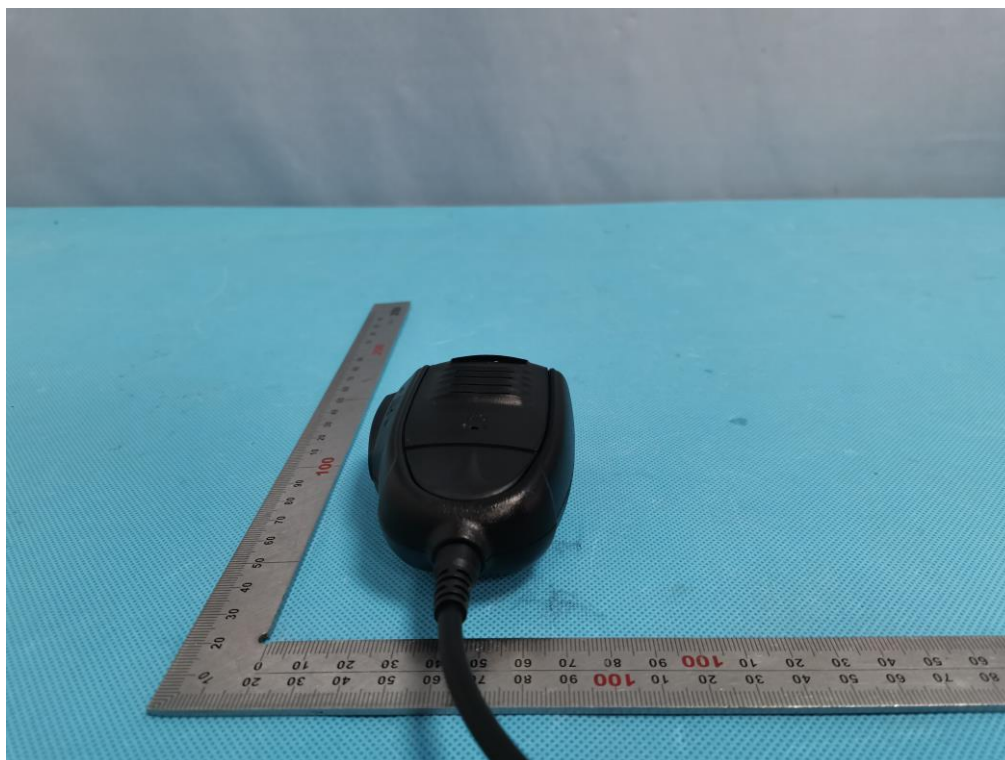
FRONT VIEW OF EUT