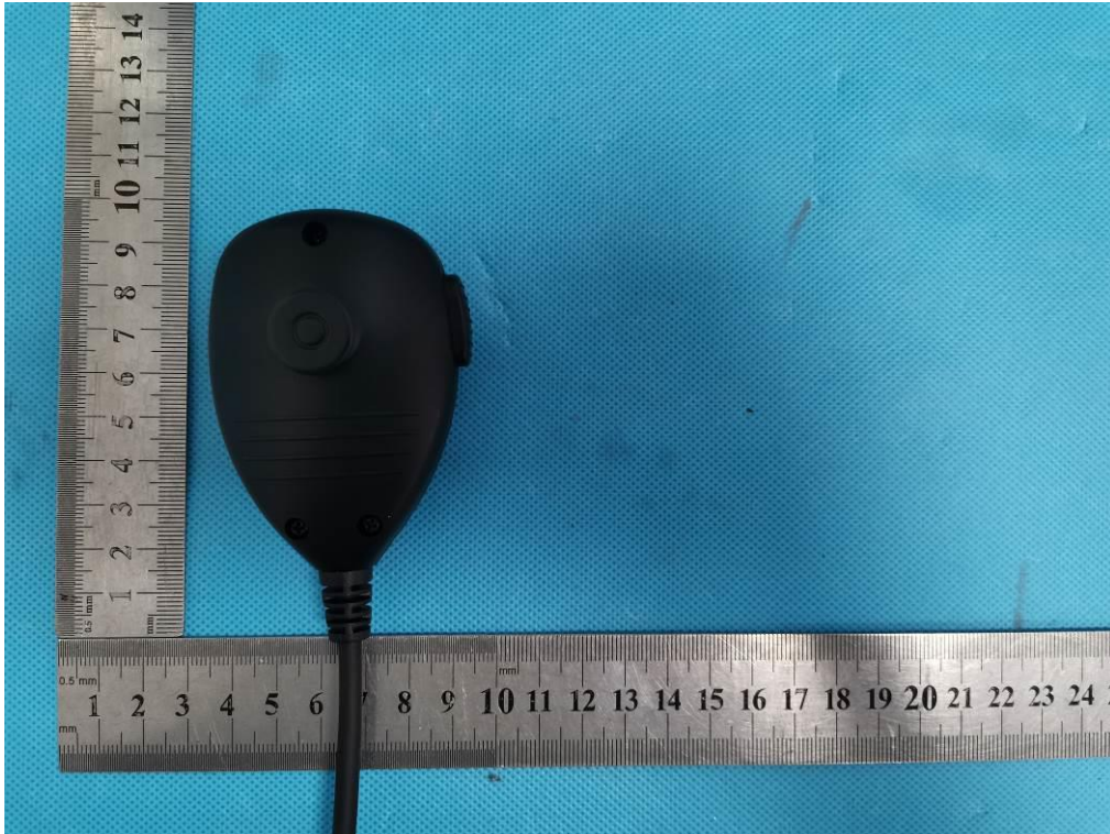
FRONT VIEW OF EUT