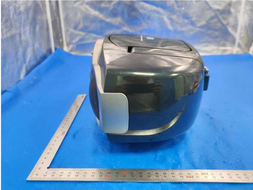
PORT VIEW OF EUT (FIGURE 1)