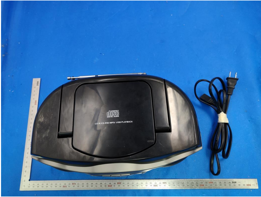
TOP VIEW OF EUT