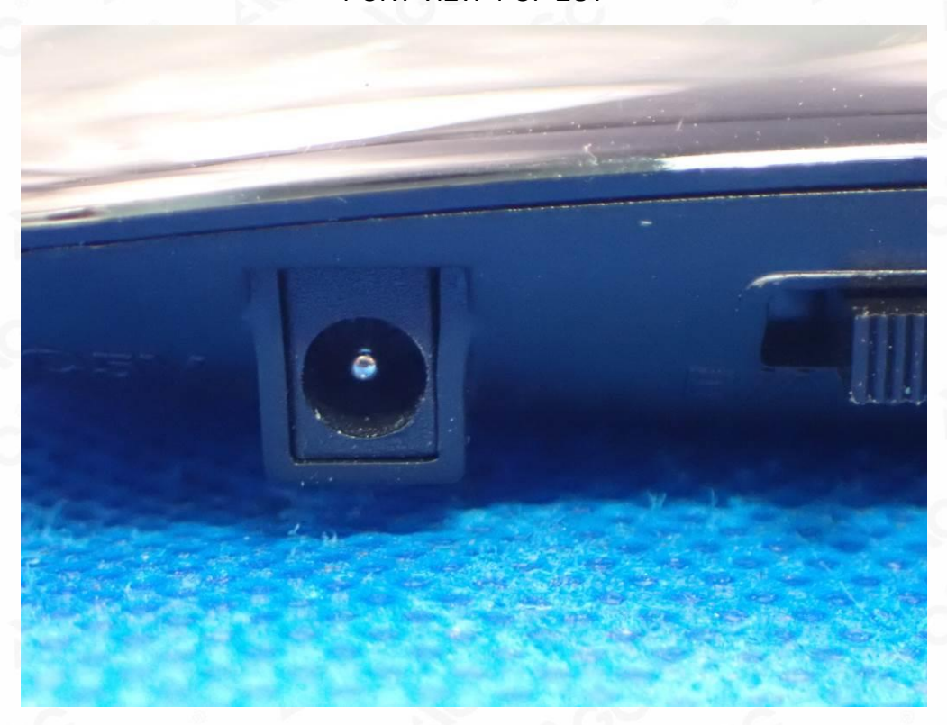
PORT VIEW-2 OF EUT