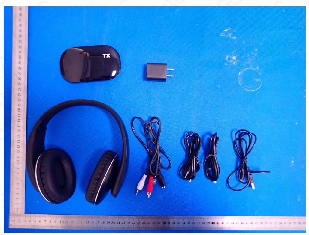
ALL VIEW-2 OF EUT