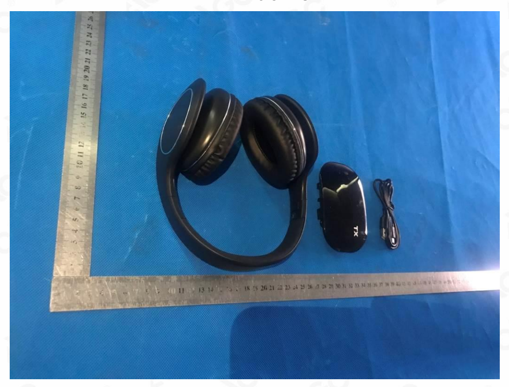
ALL VIEW-4 OF EUT