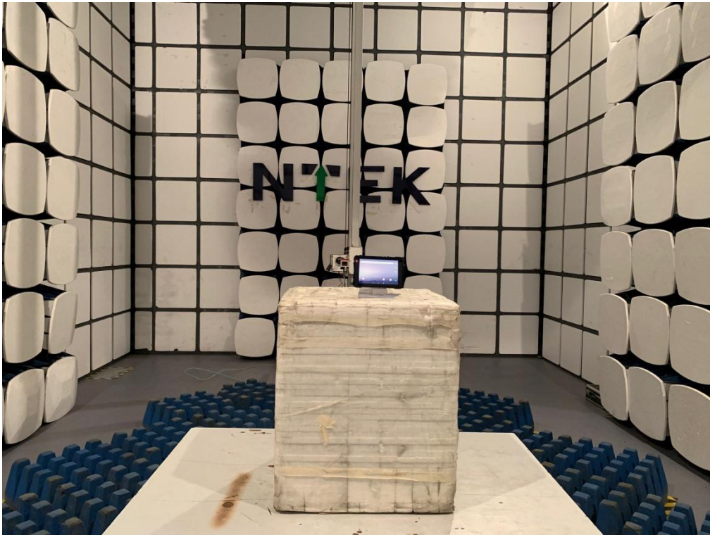
Conducted Measurement Photos