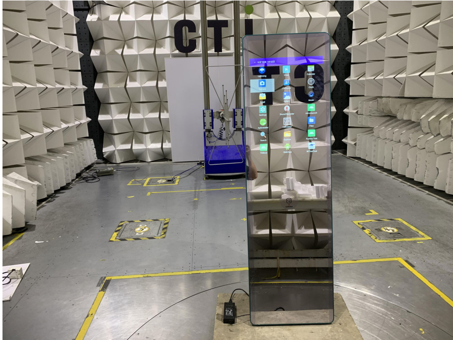
Radiated spurious emission Test Setup-1(Below 1GHz)