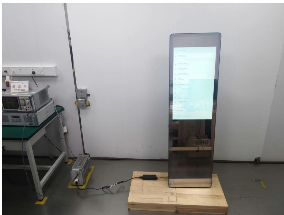
AC Power Line Conducted Emission