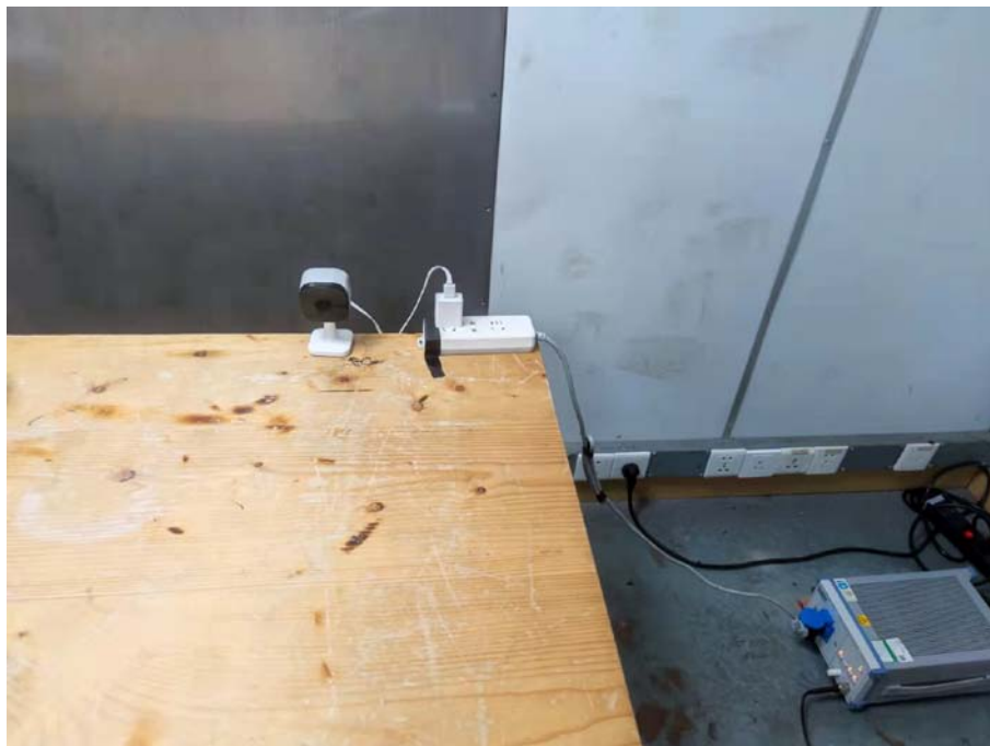
Photo of Conducted Emission Measurement