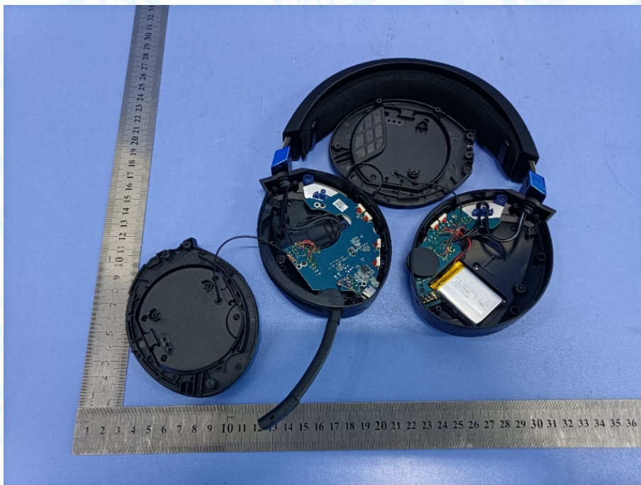
Photo 10 Appearance of Battery