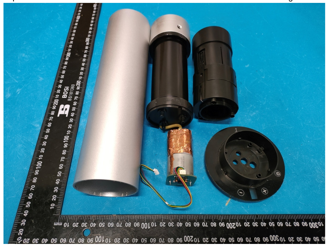
Page 3 of 3