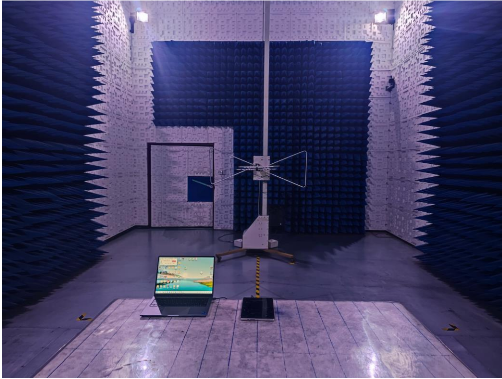
RADIATED EMISSION TEST SETUP ABOVE 1GHz