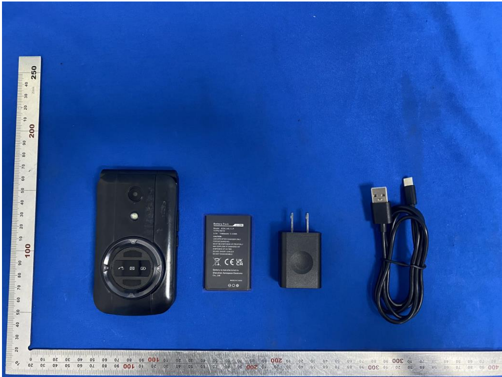
TOP VIEW OF EUT