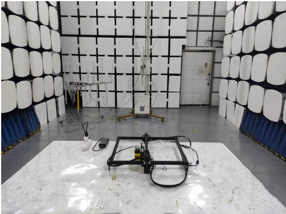
Fig. 1 (Below 1GHz)