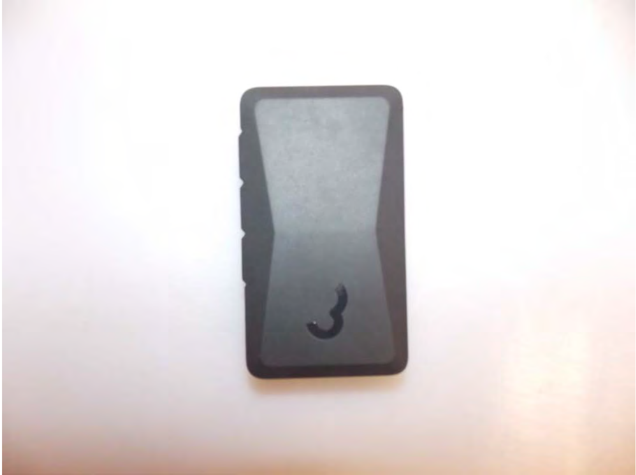
Front of Device