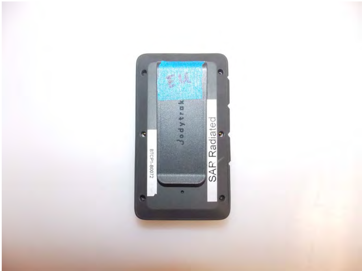
Back of Device