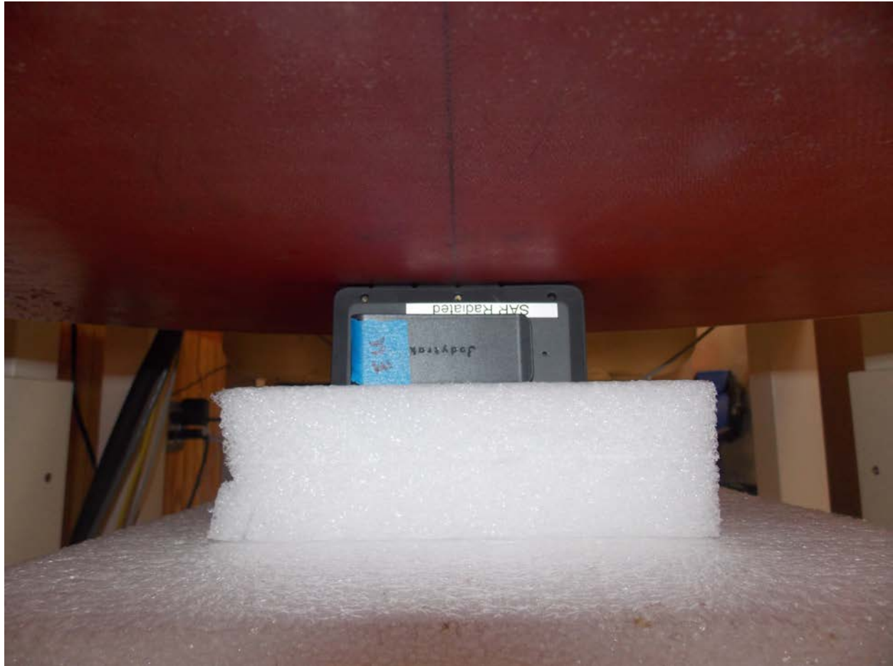
Test Position Left 0 mm Gap