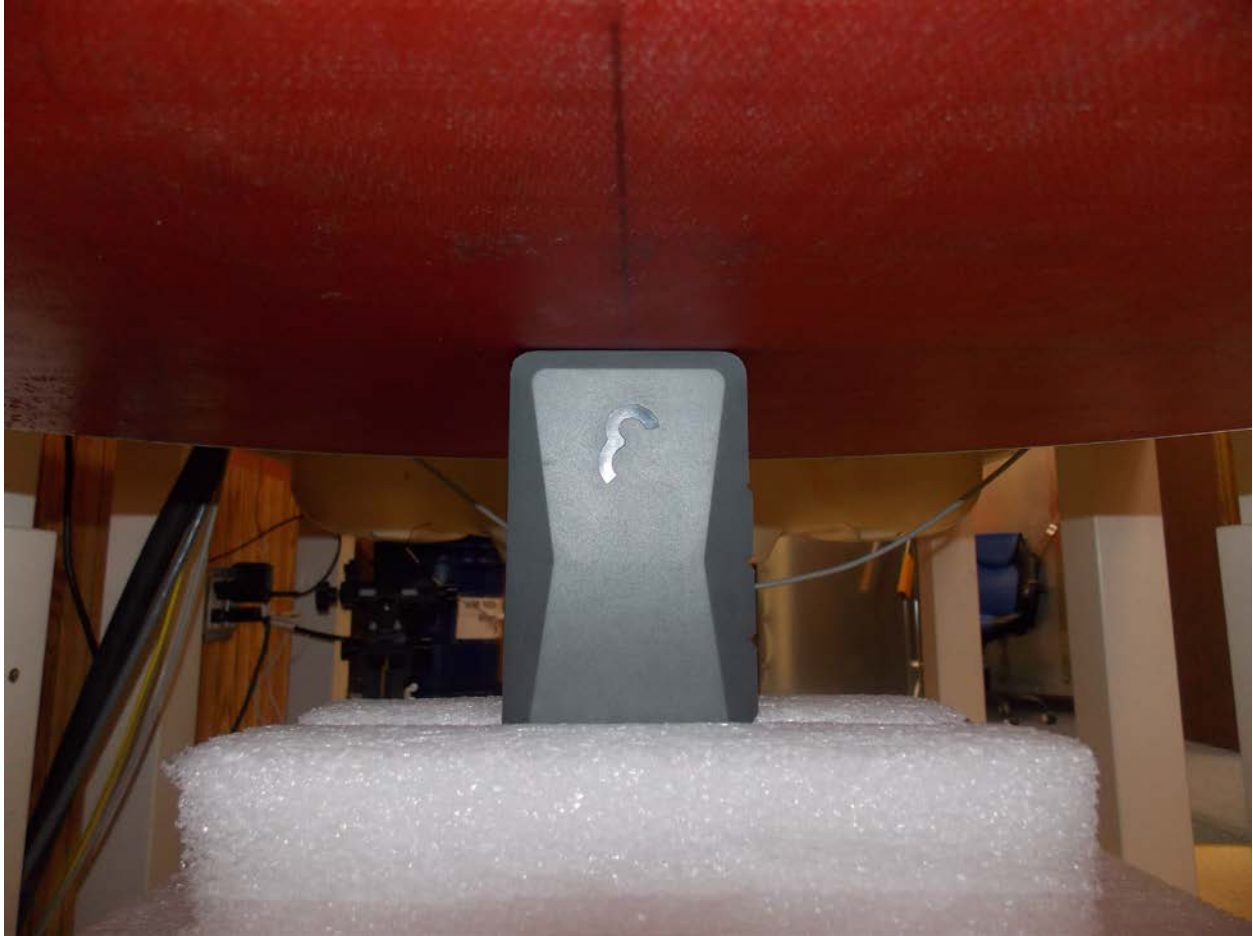
Test Position Bottom 0 mm Gap