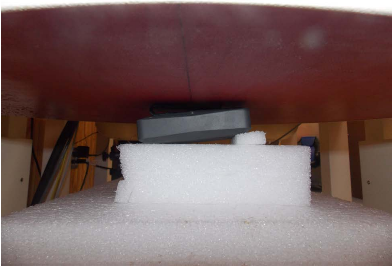
Test Position Back 0 mm Gap