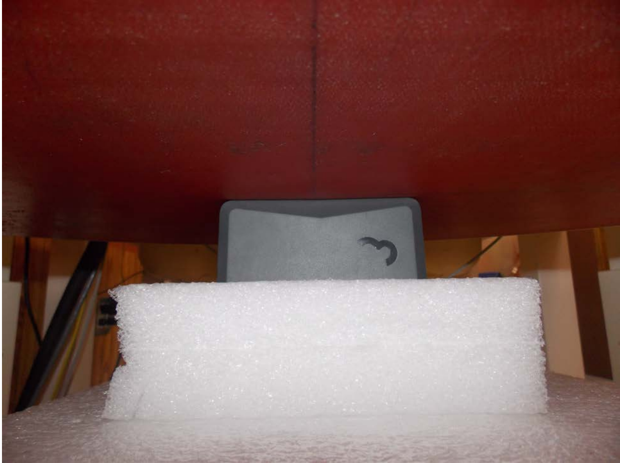
Test Position Right 0 mm Gap