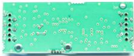
AdaptDP differential pressure sensor board