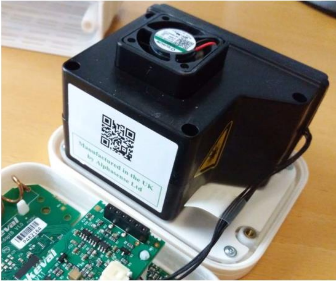
Alphasense OPC-N3 particle sensor