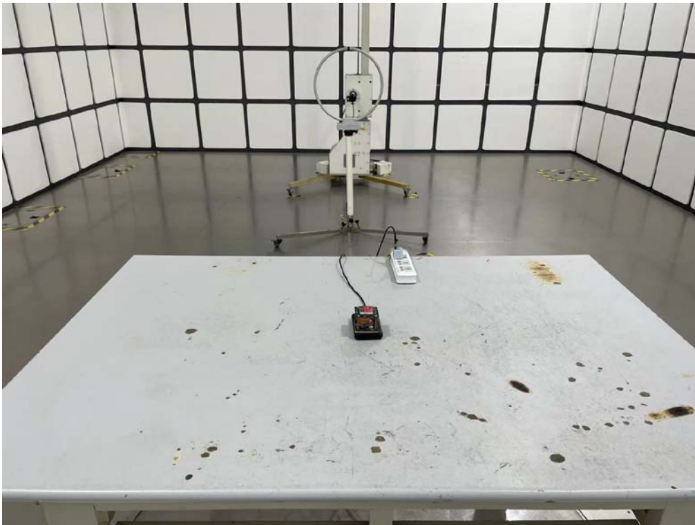
Radiated emission test: Below 30MHz