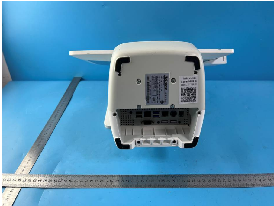
BOTTOM VIEW OF SAMPLE

Model No.: HK528 (second display:10.1 inch)