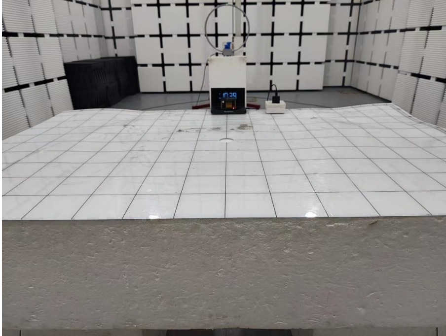
Set-up for Transmitter & Receiver Spurious Emissions, 30MHz to 1000MHz