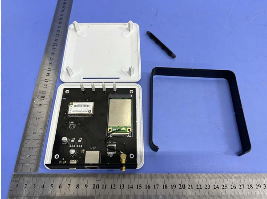
Photo 9 Appearance of PCB