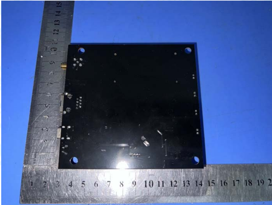
Photo 7 Appearance of Adapter