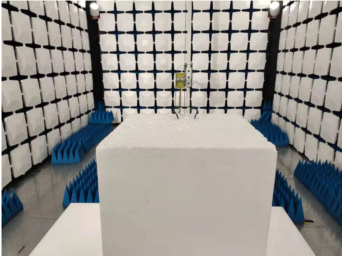
Above 1GHz for radiated emission test setup