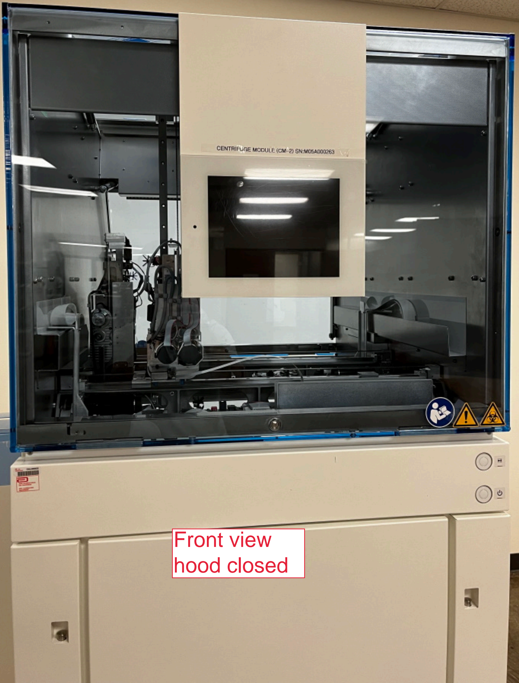
Front view hood closed