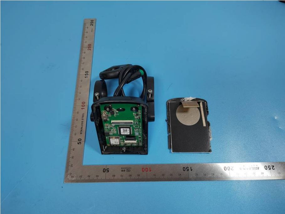
INTERNAL PHOTO OF SAMPLE