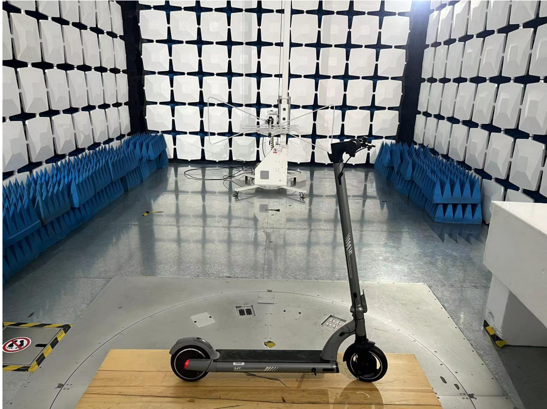
Above 1GHz for radiated emission test setup